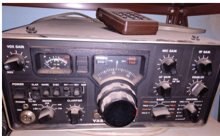
Yaesu FT-221. $200.