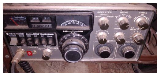
Kenwood TS-700A transceiver. $150.

Two Sharp Both Sides Play record players for vinyl LPs. Currently not working. $400 each. After repair, will ask for approximately $600 each.