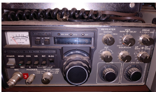
Kenwood TS-700S transceiver. $275 with MC-60 mic.