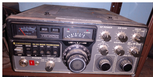
Kenwood TS-600 transceiver. $275 with MC-60 mic.

One generic desk mic equivalent to a Sadelta Echomaster Plus. $30