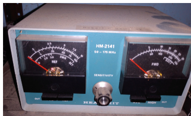
Heathkit HM-2141 VHF (50-175MHz) meter $75.