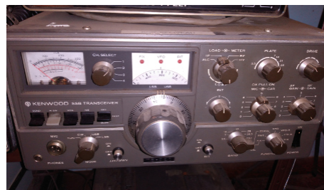
Kenwood TS-520 transceiver. $200.