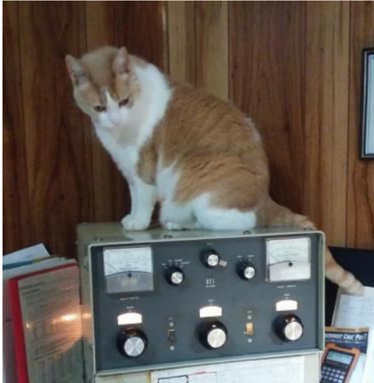
Fiddler, watching from atop a BTI amplifier