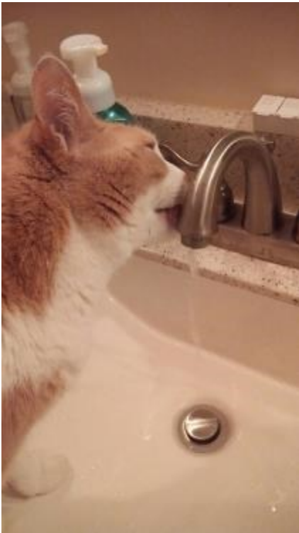
Drinking after getting his teeth brushed.