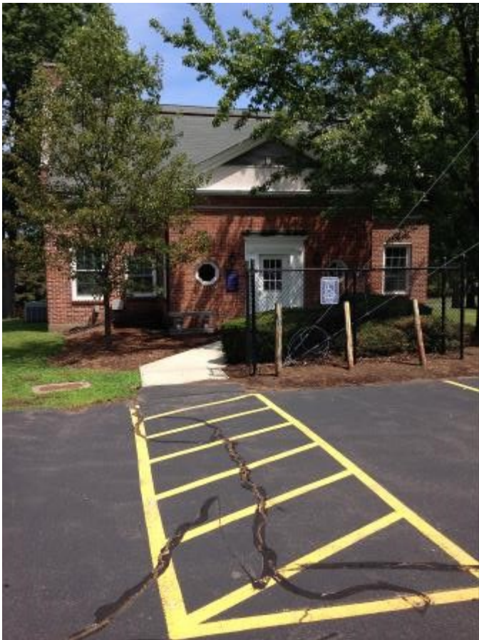
View of Rear Door into W1AW