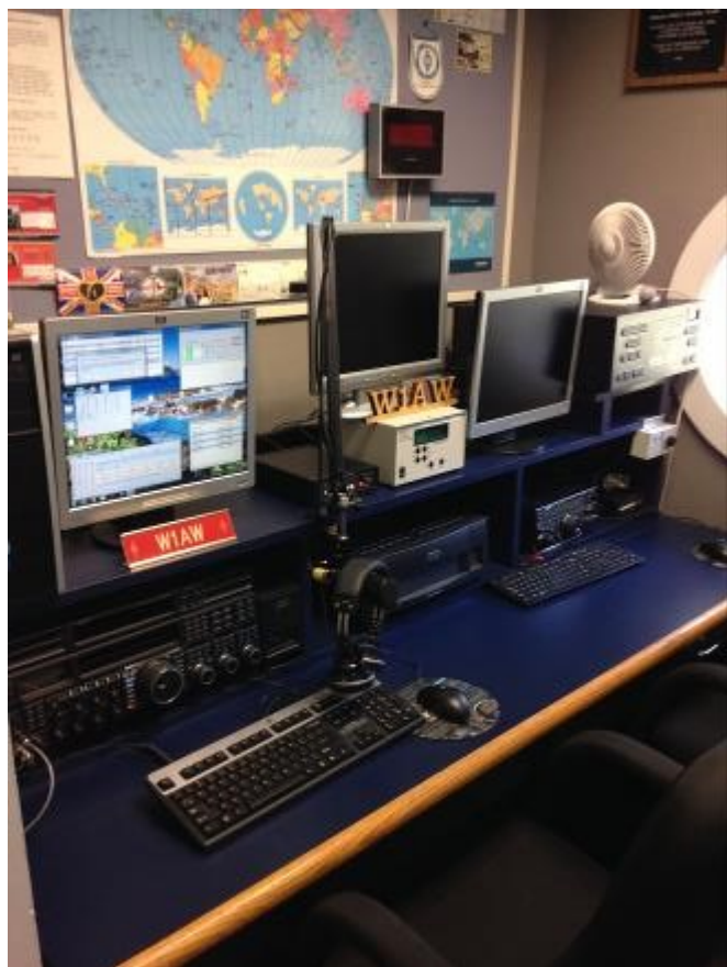
W1AW Another Station