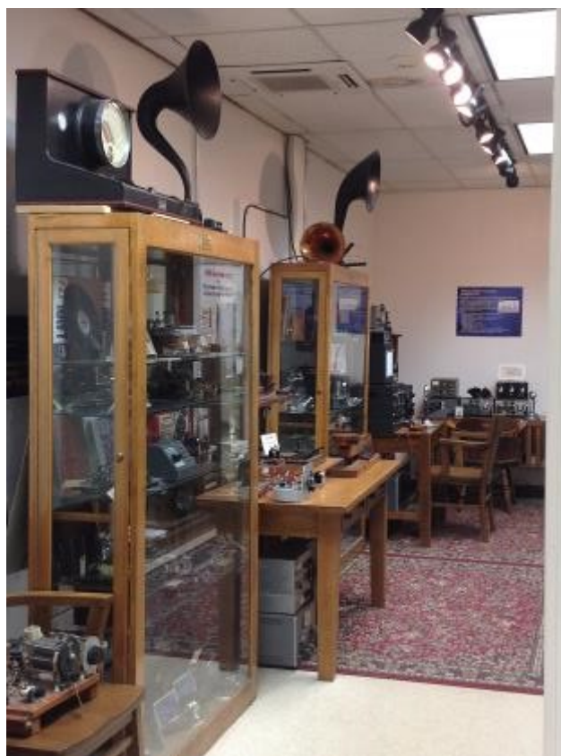
Vintage Radio Equipment