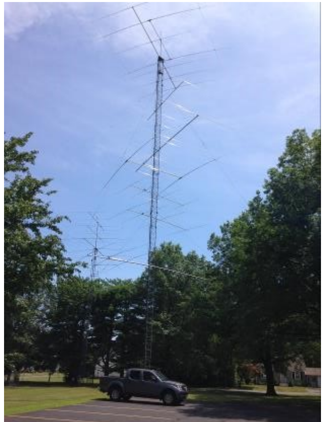
One of Several Towers and Antennas