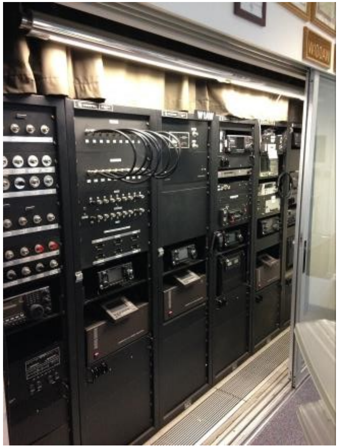
W1AW Transmitters for Code Practice