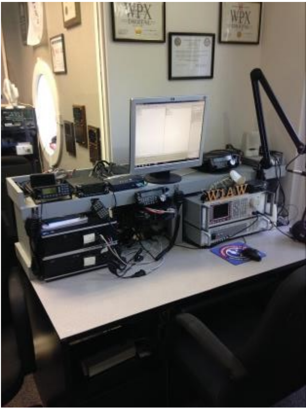
W1AW Test Bench