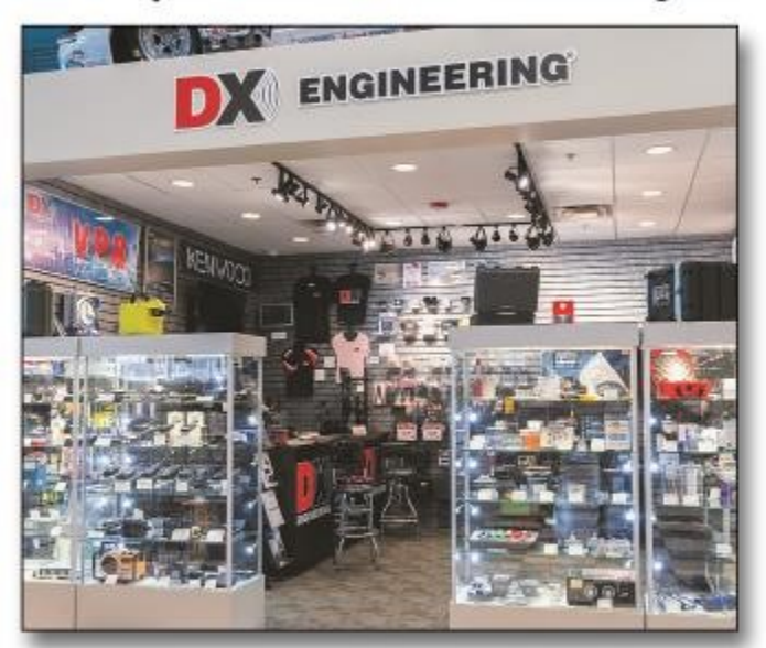
The DX Engineering Retail Showroom Inside the Summit Racing Retail Super Store 1200 Southeast Ave., Tallmadge, Ohio