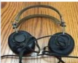
WWII ANB-H-1 Cushioned Headphones $30.00