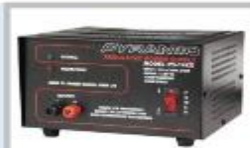
Pyramid PS-14KX 12amp Power Supply $30.00