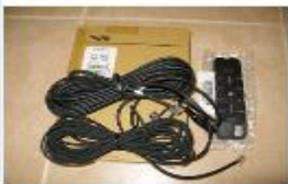
Yaesu YSK-7800 Separation Kit New in box. $30.00