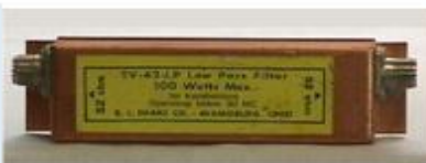
Drake TV-42-LP Low Pass Filter $5.00