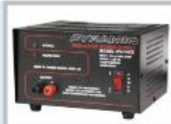
Pyramid PS-14KX 12amp Power Supply $30.00