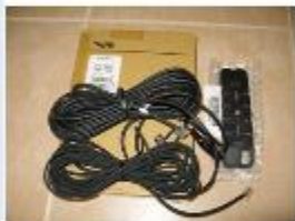
Yaesu YSK-7800 Separation Kit New in box. $30.00