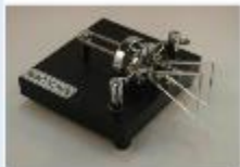
Bencher BY-1 Key $60.00