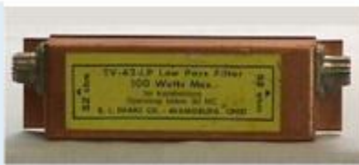
Drake TV-42-LP Low Pass Filter $5.00