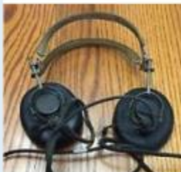
WWII ANB-H-1 Cushioned Headphones $30.00