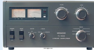
Kenwood TL-922 Linear Amplifier

trol box with manual. Has been repaired and updated by cats rotor doctor. $500