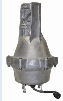
Hy-Gain T2X Tailtwister Rotor with manual and con-

trol box with manual. Has been repaired and updated by cats rotor doctor. $500