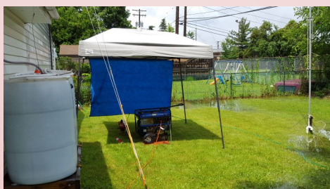
Generator next to my new swimming pool provided by Mother Nature