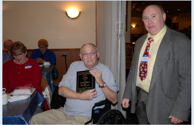
Presidents Award: Al N8CX

More pictures on Photo Gallery at www.noars.net