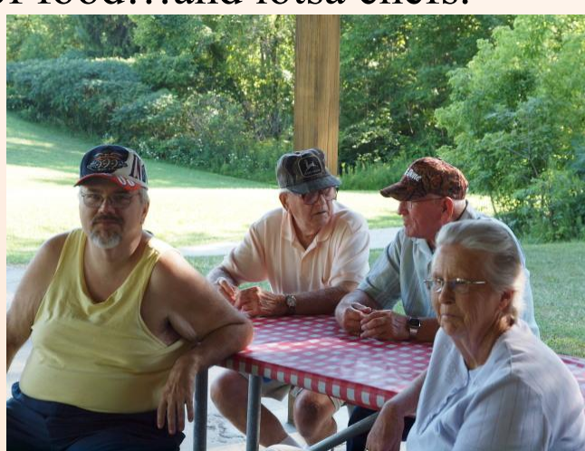
Lotsa friendship and eyeball QSO's, too.

This year broke records with 53 attendees.