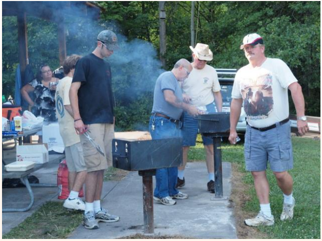
There was an abundance of food...and lotsa chefs.