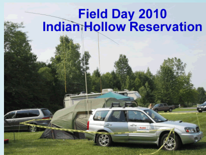
W8KRF FD Setup