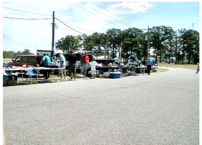
More Flea Market Scenes What A Beautiful Day We Had !!