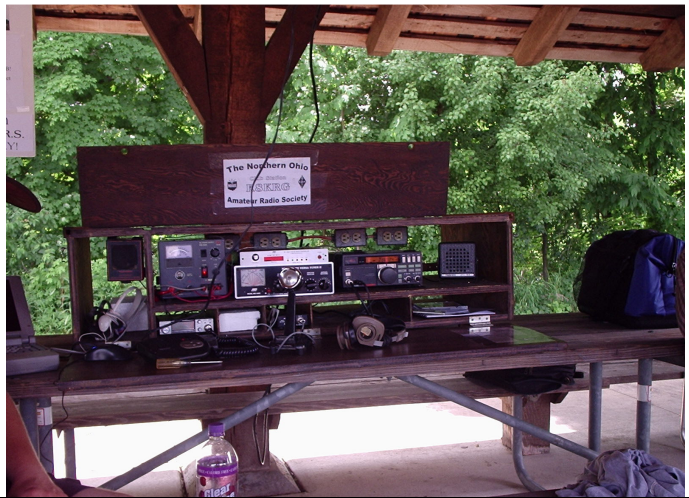
Début of the WA8KVU Memorial Station Rear and Front View