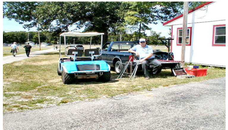
W8TAS Enjoying The Fine Weather In The Flea Market