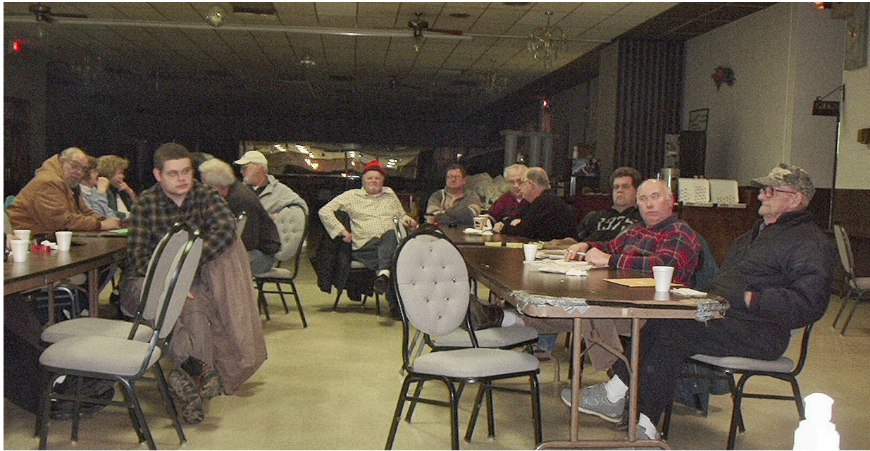
The January 15, 2007 Meeting Attendees