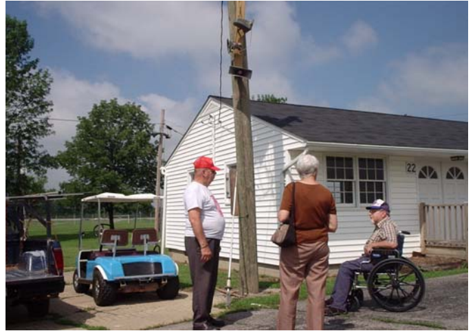
Blue Skies And A Pretty Blue Golf Cart!