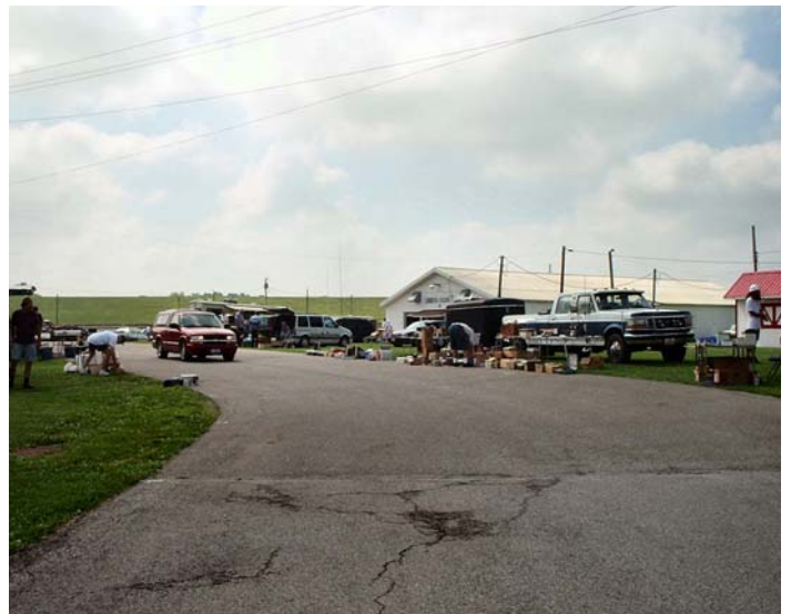
Flea Market Galore !