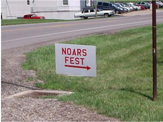
Welcome to NOARSFEST 06!

Color Photos In E-Version Of NOARSLOG At: www.noars.net