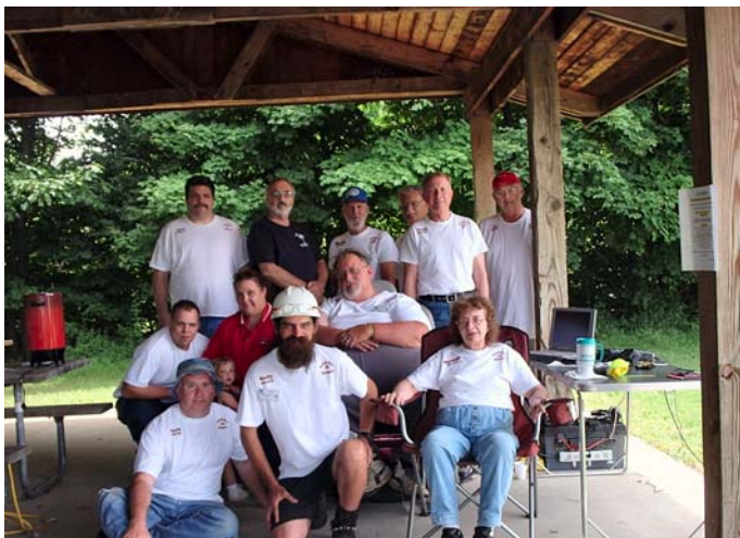
The Field-Day Crew (Left-Right) K8JWS - W8KYZ - WD8OFG - K8ECK - W8KRF - N8CX KD8DTG - KD8DZL - WD8IQJ - KA8VTS N8PZD - N8OFS

Color Photos in E version of NOARSLOG available at www.noars.net