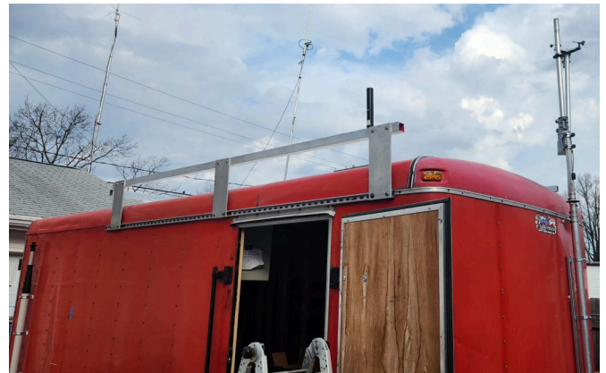
ARES Vehicle with the COMPACTenna 2Meters/440+ antenna en situ