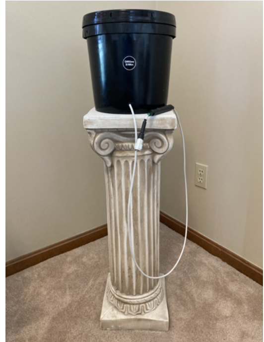
20/40Micro. a tiny antenna for the 20 & 40 Meter HF Bands